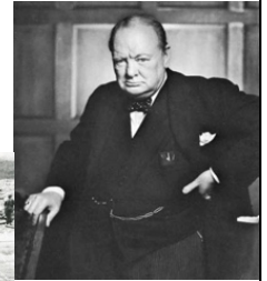
D-Day 6 th June 1944