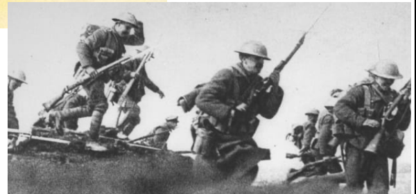
Battle of the Somme